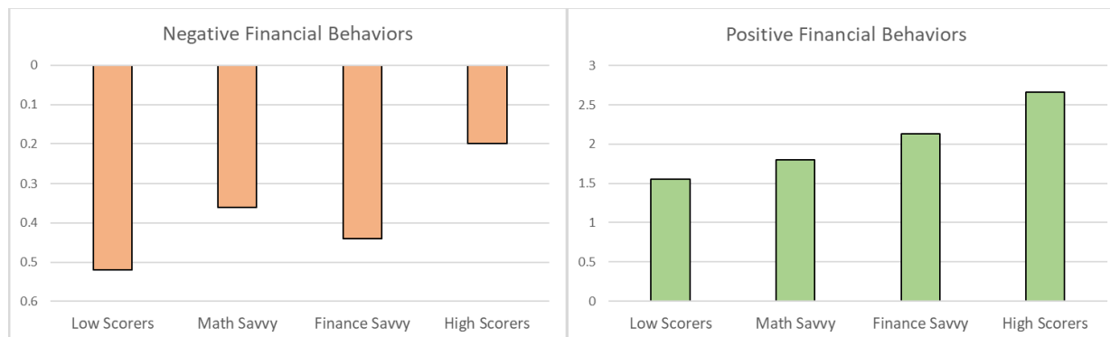
Figure 1: Association Between Knowledge and Total Financial Actions Taken 15

Financial education research more generally shows that people with financial education have greater financial confidence than those without and therefore engage in more financial activities across the board. Unfortunately, these people engage in more harmful financial activities as well as beneficial ones. Math knowledge is a differentiator, whereby negative actions are reduced and positive actions are retained and even increased. This aligns with our belief that math skills are required to build conceptual understanding in finance. Understanding the underlying mathematics allows people to critically analyze which of the myriad financial products offered will be beneficial to them.